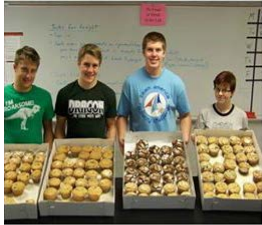
Students at Medford Area Senior High School baked and sold more than 9,000 jumbo-sized muffins to fund their team using more than \frac{3}{4} ton of muffin mix, 200+ pounds of chocolate chips and 40+ pounds of blueberries!

If you have a unique fundraiser, let us know! Tweet at us (@rocketcontest), post it to our Facebook page, or email it to us at rocketcontest@aia-aerospace.org .